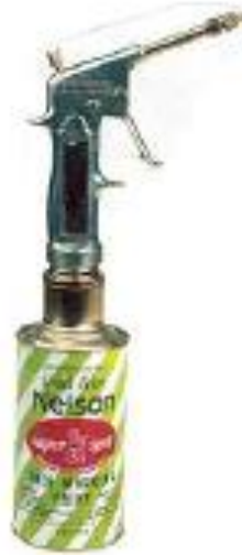
Tree Marking Gun