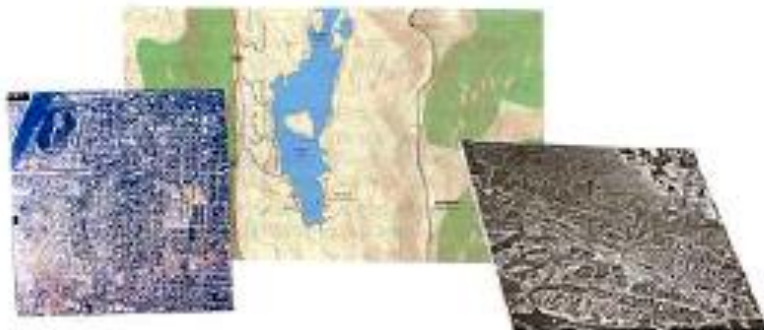
Maps & Aerial Photos