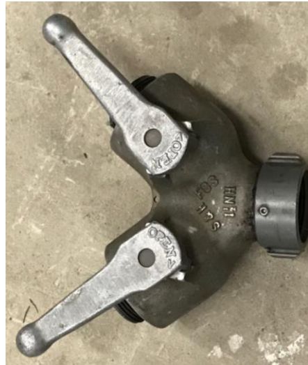
Gated 'Y' (large)