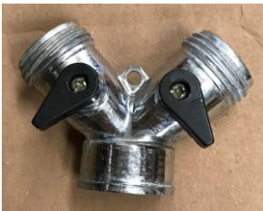
Gated 'Y' (small, for mop-up)