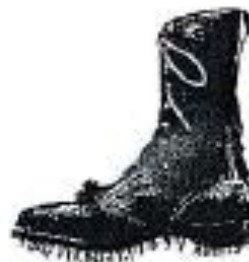
Caulk (Cork) Boots